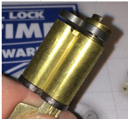
Remove 7-pin SFIC core. The rotation plate and driver will come with it