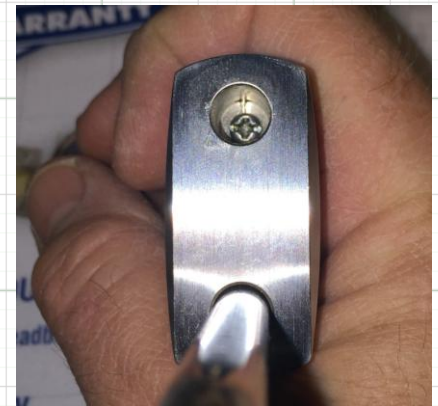
Re-install the retaining screw. Remove the core.