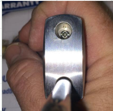
Remove the rotation plate retaining screw. Relock the padlock