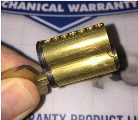
Install a 7-pin SFIC core. Use it to unlock the padlock