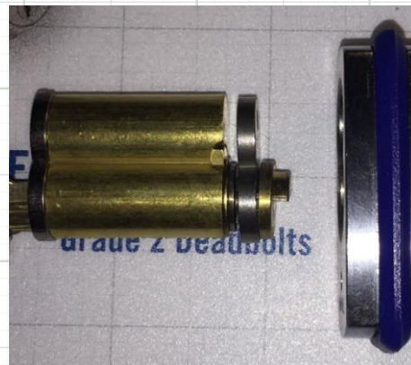
Re-install the 7-pin SFIC core, rotation plate and driver. Lock the core into place