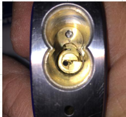
Using a 1.5mm Allen wrench, turn set screw Clockwise to open the shackle. Then turn set screw counter clockwise to remove the key retaining set screw.