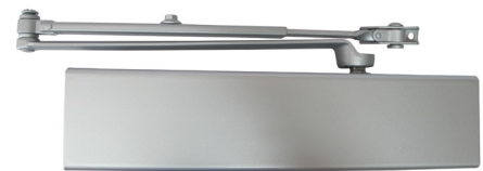
CX7516 – Full Cover